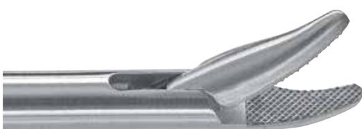
TC Serrated Jaws