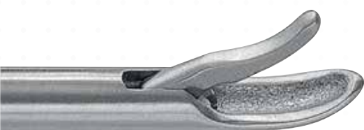
Diamond Dusted Jaws